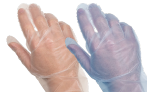
DOMESTIC POLY GLOVES