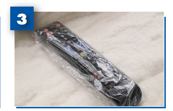
SEAL SLEEVE BY USING THE FLIP-LOCK SYSTEM